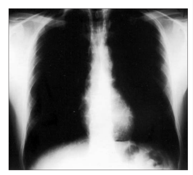
Fig. 1. - Chest X-Ray of the patient: no abnormality is visible.

The patient was a 26 years old, medical assistant, non-smoker, previously in good health. He presented to the department of pulmonology for evaluation of the purified protein derivative skin test performed 48 hours ago. The mantoux reaction was positive (in duration 12 mm). He denied fever, dry cough, weight loss, and fatigue, laboratory examinations were noncontributory, and the physical examination was unremarkable. The cause of performing the mantoux reaction was an overall check up triggered by an accidental piercing with a contaminated needle during work. The exams included HIV, Hepatitis B and C testing. The patient denied BCG vaccination in the past, and did not recall the outcome of a previous tuberculin skin testing. Chest-X-ray (CXR) was normal (figure 1). Because of his high occupational risk for TB exposure, chest computed tomography (CT) and bronchoscopy were subsequently performed. Positive acid-fast bacilli were detected in bronchial washing smears and cultures. CT scan revealed distortion of the bronco vascular structures and cavity formation at the upper left lobe (figure 2). Complete antituberculous therapy was commenced -Rifampicin and Isoniazed for 9 months, and Pyrazinamide and Ethambutol for 2 months, because the radiographic findings revealed cavitary TB. No side effects during therapy were observed. Follow up bronchoscope after the completion of the antimycobacterial therapy was