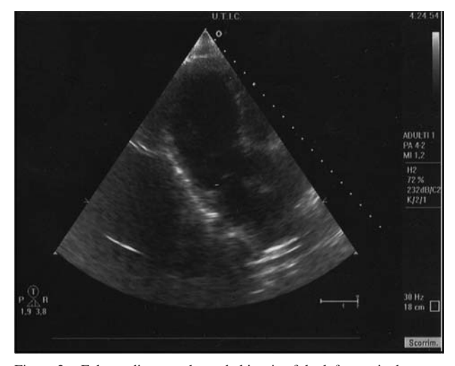
Figure 2. - Echocardiogram showed akinesis of the left ventricular apex with overall left ventricular systolic function being severely impaired (EFVS: 28%).

Blood analysis revealed an increase in the creatine kinase MB fraction (plasma peak was 75,98 ng/ml), a significant positive detection in troponin T (plasma peak was 2,850 ng/ml), a white blood cell count of 35540 per microliter with 87,5% of neutrophilis, C -reactive protein of 59,9 mg/dl. The results of thyroid function test were as follows: thyroid stimulating hormone (TSH): 0,005 uU/ml (normal range, 0,270 - 4,200), free triiodothyronine (fT3): 7,44 pg/ml (normal range, 2,00 - 4,40), free thyroxine (fT4): 3,28 ng/ml (normal range, 0,93 - 1,70), thyroid globulin antibody: 3000 UI/ml (normal range, < 40), thyroid peroxidase antibody: 1000 UI/ml (normal range, < 35), TSH receptor antibody: 69.5% (normal range, < 15,0).