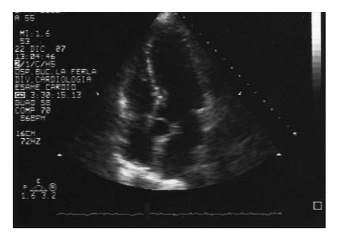
Figure 4. - Echocardiogram showed completely normal left ventricular kinesis after 18 days.