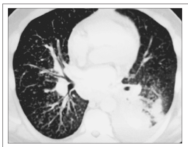
Fig. 1. - Miliary tuberculosis, in a 49 year-old man receiving Infliximab. Also noted are pericardial and left pleural effusions and sizable subcarinal adenopathy.