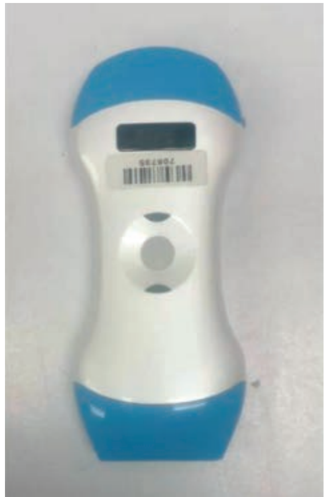
Figure 1. Image of the handheld ultrasound that was used for the pleural procedures. It connects wirelessly to a smartphone or tablet.

Over the span of 2 years, we performed a total of 549 chest ultrasounds for the evaluation of pleural effusion. A total of 217 patients did not undergo a pleural procedure. Of them, 204 patients had either no effusion or had a minimal effusion that was not amenable to an intervention, and 13 patients had a highly loculated effusion on ultrasound evaluation, warranting management via video-assisted thoracoscopic surgery (VATS). A total of 332 pleural procedures were attempted, of which 329 procedures had successful aspiration of pleural fluid, while 3 patients had an unsuccessful drainage. Of the 3 patients, 2 had large-bore chest tubes placed for empyema without any drainage, and 1 had a dry tap performed. The remainder 329 patients underwent successful pleural procedures using the handheld ultrasound guidance, and no patient required the subsequent use of a conventional ultrasound machine during the procedure or subse-