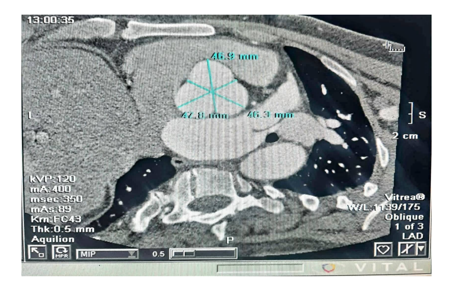
Figure 2. Measurement of aortic root diameter (ARD).