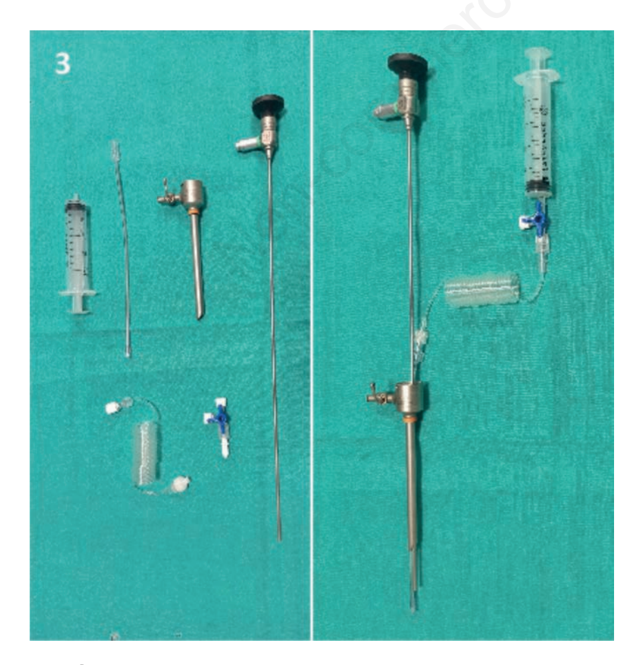
Figure 3. Syringe connected to the MADgic<sup>®</sup> to instill urokinase through the thoracoscope.

Intrapleural administration of fibrinolytic agents, such as streptokinase and tissue plasminogen activator (tPA), has been widely used to lyse fibrin primarily in cases of pleural infection (complicated pleural effusion or empyema). It has been shown that the use of intrapleural fibrinolytics increases the volume of drained pleural fluid, decreases hospital length of stay, and improves radiographic outcome [3]. In patients with malignant pleural effusion who developed a loculated effusion, fibrinolytics have been used to break down the septations, with the ultimate scope of relieving breathlessness and improving pleurodesis success. Thoracic ultrasound performed before and after administration of pleural fibrinolytic demonstrates the dissolution of septations. All the reports and trials reported in the literature described pleural fibrinolysis through an indwelling pleural catheter [4]. The risk of pleural hemorrhage is a particular concern in malignant pleural effusion, where pleural tumor stimulates the development of new blood vessels, which can be friable and prone to bleeding. Of the various studies carried out on the use of fibrinolytics in malignant