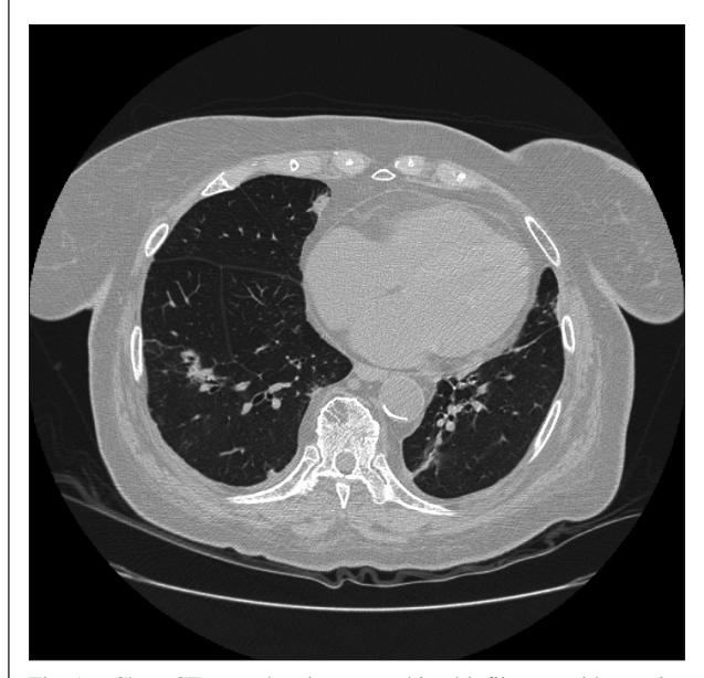
Fig. 1. - Chest CT scan showing parenchimal infiltrates with not significant lymphoadenopathy.

A chest xray showed bilateral pleural effusion predominant on the right side and bilateral pulmonary infiltrates. The CT scan confirmed the presence of bilateral parenchimal infiltrates with bilateral pleural effusion, more predominant on the