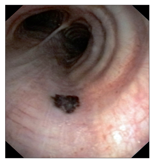
Fig. 2. - Centimetric flat and black pigmented area in the pars membranacea of the trachea.