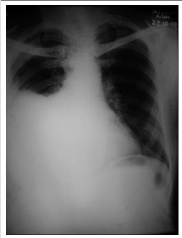
Fig. 1. - Chest x-ray PA view showed homogenous opacity in right lower lung field with blunting of costophrenic angle (CPA) suggestive of pleural effusion.

pleural fluid. He was referred to a medical oncology department for further management. He was given six cycles of decarbazine, vincristine and cisplatin. The patient responded well and has been asymptomatic for the last year.