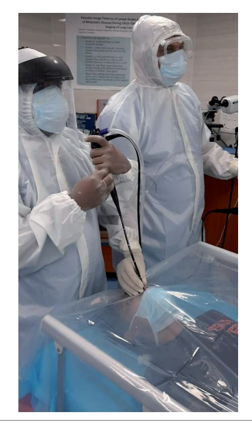
Figure 1. The arrangement made for conducting the bronchoscopy procedures with personal protective equipment including faceshield, using the polypropylene sheet tent.

We also assessed the number of personnel involved and increase in the approximate cost of the procedure pre lockdown and during the lockdown period. Patients underwent RT-PCR for