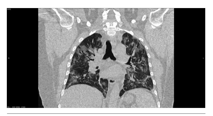
Figure 3. Coronal reconstruction in lung window showing diffuse bilateral infiltrations.