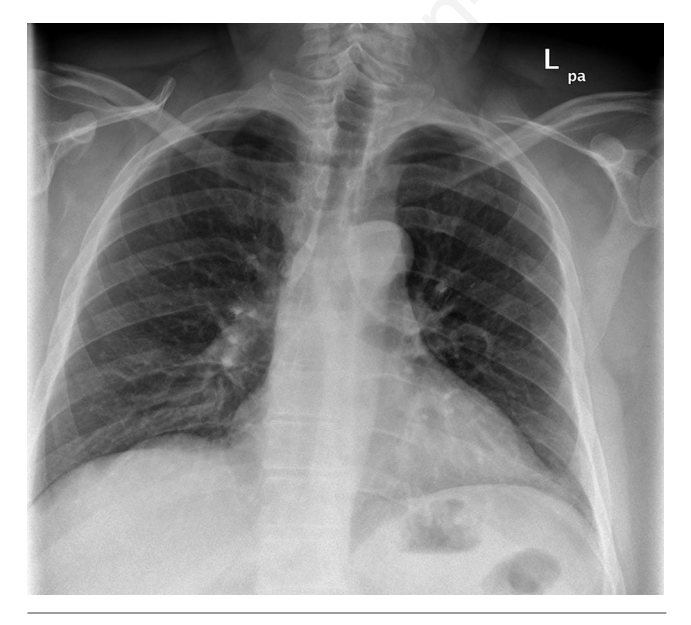
Figure 1. Chest X-ray on admission.