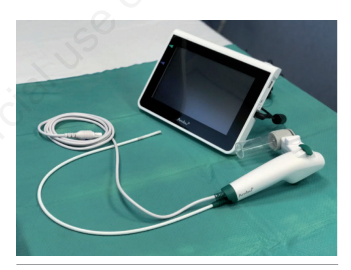
Figure 3. Disposable single-use bronchoscope, with dedicated monitor.

Preparation for videobronchoscopy consists of the dressing phase (Table 2) performed in a room outside the isolation room, performing the procedure in front of another trained operator in order to avoid mistakes. The dressing procedure, in the experience