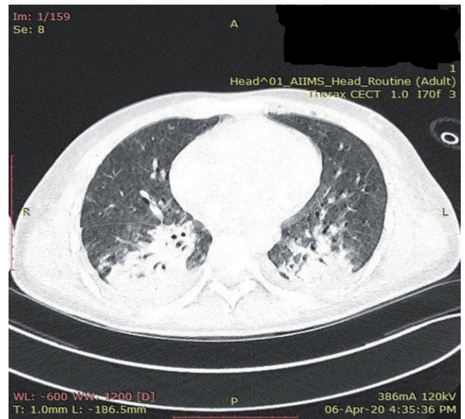
Figure 2. Computed tomography of the chest in the pulmonary window revealed centrilobular nodules with 'tree-in-bud' appearance.