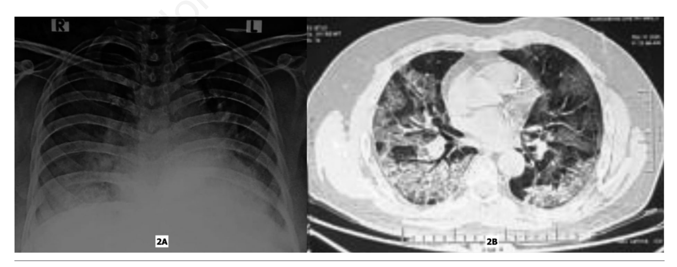
Figure 2. A) Chest radiograph postero-anterior view of a 45-year-old female with hypertension and diagnosed with COVID-19 showing bilateral lower zone infiltrates. B) High resolution computed tomography of the chest of a 47-year-old male showing bilateral ground glass opacities, a finding frequently encountered in COVID-19 positive patients.