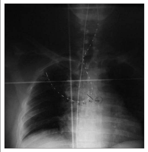
Fig. 1. - Radiograph after catheter positioned to calculate the target area.

All the consecutive patients needing palliative treatment to resolve bronchial obstruction for lung cancers were considered for HDREB on an outpatient basis. Inclusion criteria were: histological evidence of malignant tumour not susceptible to surgical treatment for extension or co-morbidity. Exclusion criteria were: impediments to correct bronchoscopic catheter insertion; poor performance status (ECOG>2) to contraindicate repetition of bronchoscopy; informed consent not granted.